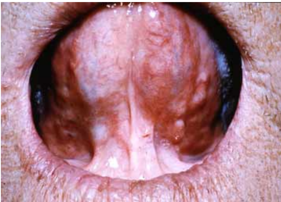
Figure 2 The patient after radiation therapy to the squamous cell carcinoma.